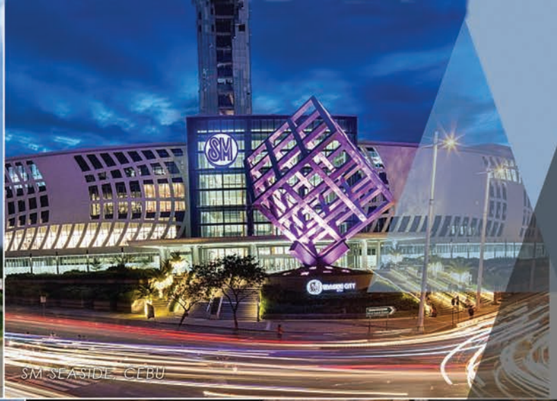
SM SEASIDE, CEBU