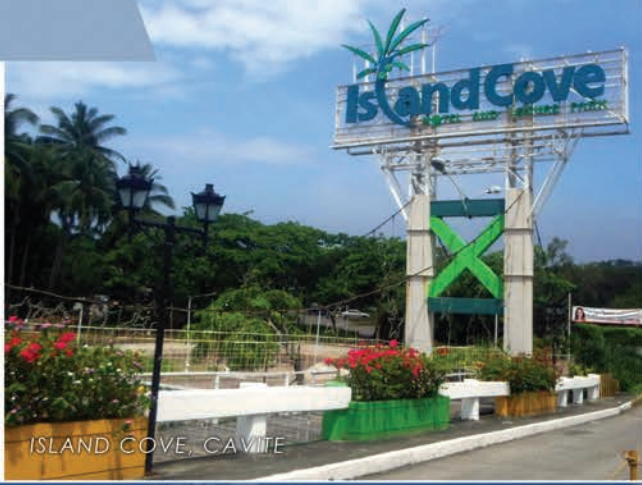
ISLAND COVE, CAVITE