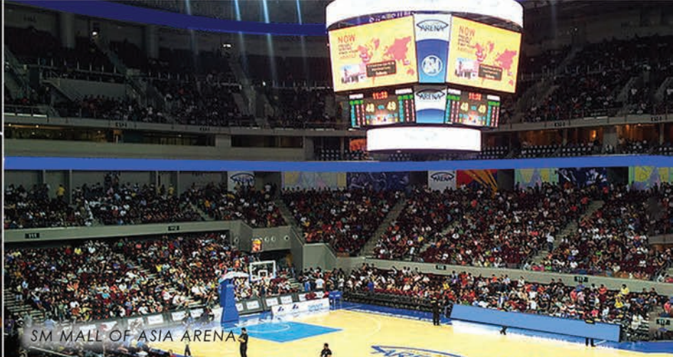
SM MALL OF ASIA ARENA