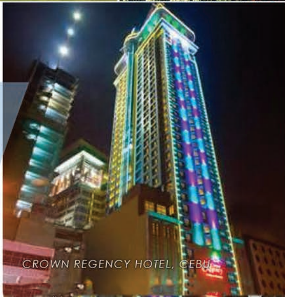
CROWN REGENCY HOTEL, CEBU