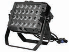
LED Wash Light