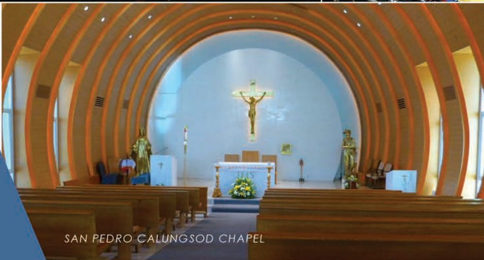
SAN PEDRO CALUNGSOD CHAPEL