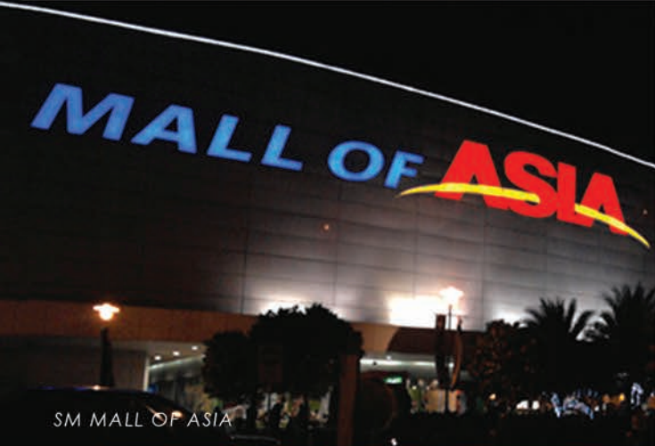
SM MALL OF ASIA