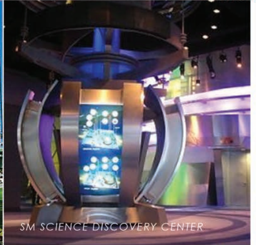
SM SCIENCE DISCOVERY CENTER