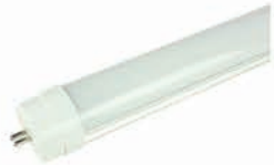
T5 / T8 LED Tube