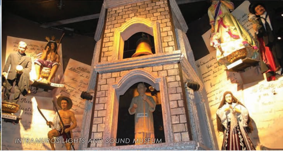
INTRAMUROS LIGHTS AND SOUND MUSEUM